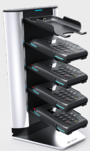
M010 Fast Charge Rack