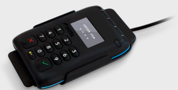
M010 Desktop Cradle