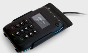
M010 Fast Charge Cradle