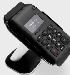
M010 Retail Cradle